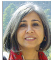
Urm Basu International Service